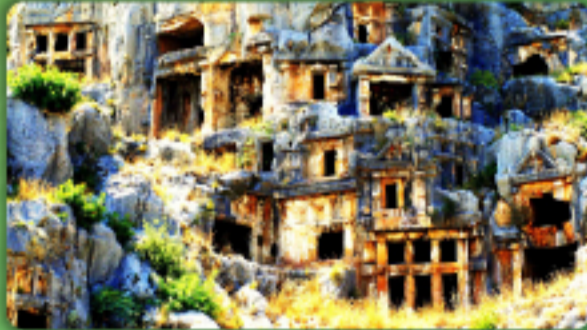
The Ancient City of Myra