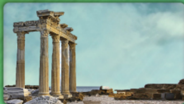
Temple of Apollo