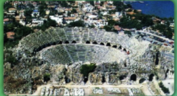
The Ancient City of Aspendos